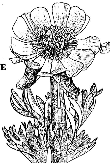
Fig. 96. R. haastii subsp. haastii from Porters Pass

Capricorn Books, FREEPOST 3551, P.O. Box 33-189, Petone. 155 Jackson Street, Petone. Ph (04)5683.208 Fax (04)5682.004 Mail order is our speciality.